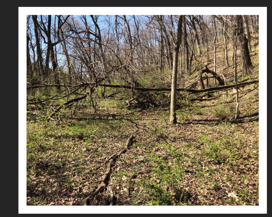
Overview of former Superintendent's Cottage in 2020, facing west.