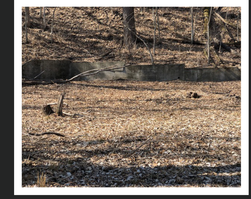
Overview of retaining wall behind cottage in 2021, facing north.